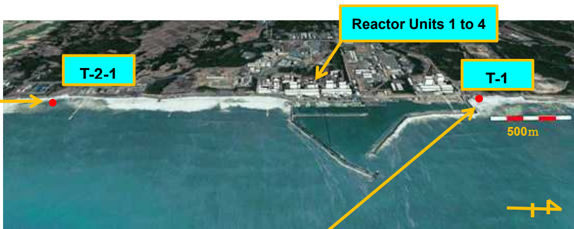
1.1km northern point (T-1) from the outlet for Reactor Units 1 to 4

http://radioactivity.nsr.go.jp/en/contents/9000/8565/24/Sea_Area_Monitoring_20140624.pdf